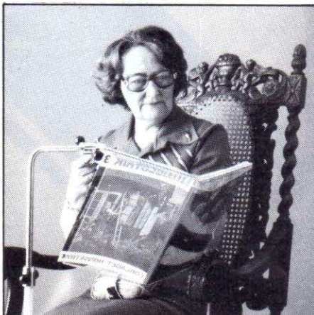
Table 1: Reading stands