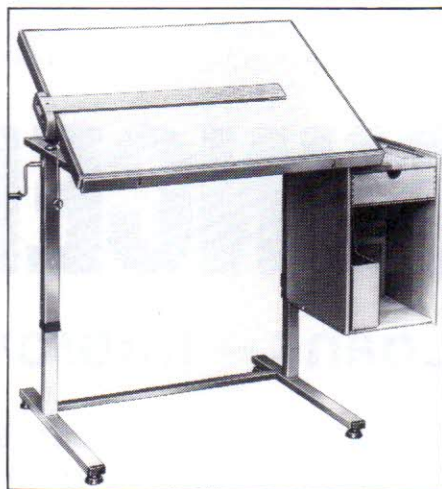
Table top reading stand from Luna AB

Luna AB , Fack, S-441 80 Alingsas, Sweden. Tel: 46 322 730 00.